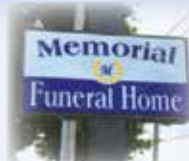
NOW: Memorial Funeral Home