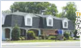
THEN: Harrill Funeral Home